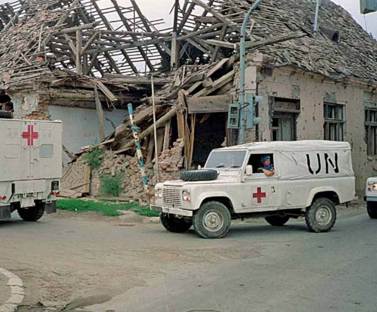
Ambulances of UN peacekeepers in Vukovar, Croatia, during the war in Croatia