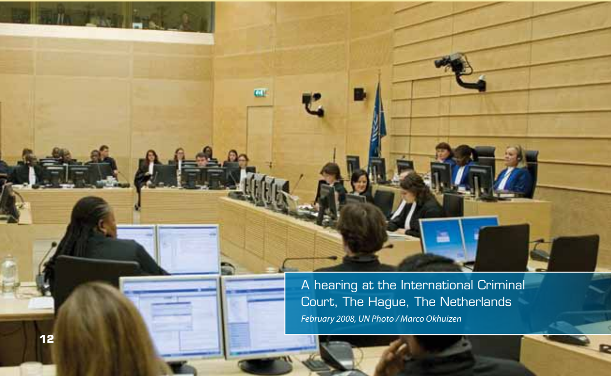
A hearing at the International Criminal Court, The Hague, The Netherlands

Where genocide does occur, the International Criminal Court (ICC), which is separate from and independent of the United Nations, is empowered to investigate and prosecute those most responsible, if a State is unwilling or unable to exercise jurisdiction over alleged perpetrators. Fighting impunity and establishing a credible expectation that the perpetrators of genocide and related crimes will be held accountable can contribute effectively to a culture of prevention.