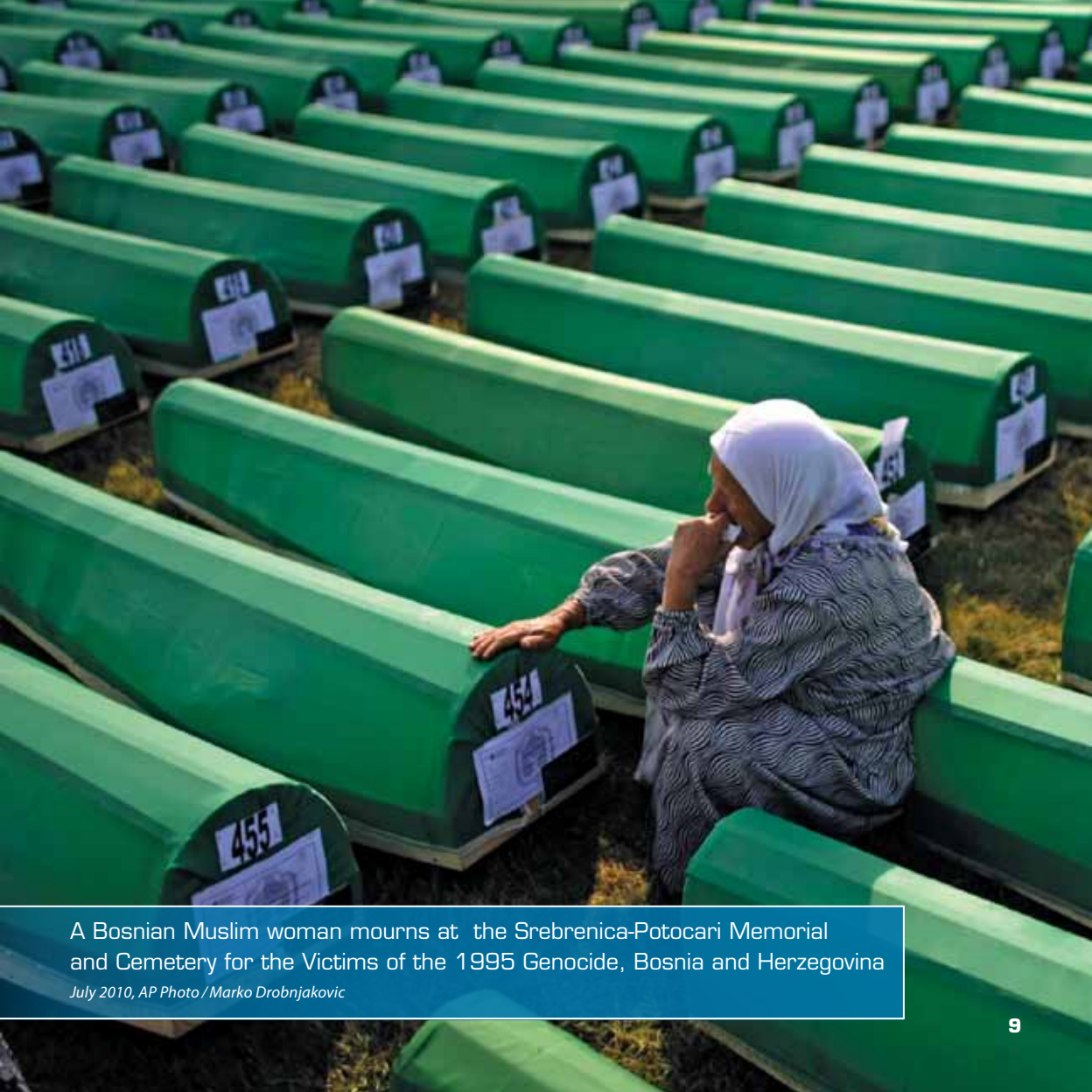
A Bosnian Muslim woman mourns at the Srebrenica-Potocari Memorial and Cemetery for the Victims of the 1995 Genocide, Bosnia and Herzegovina

July 2010