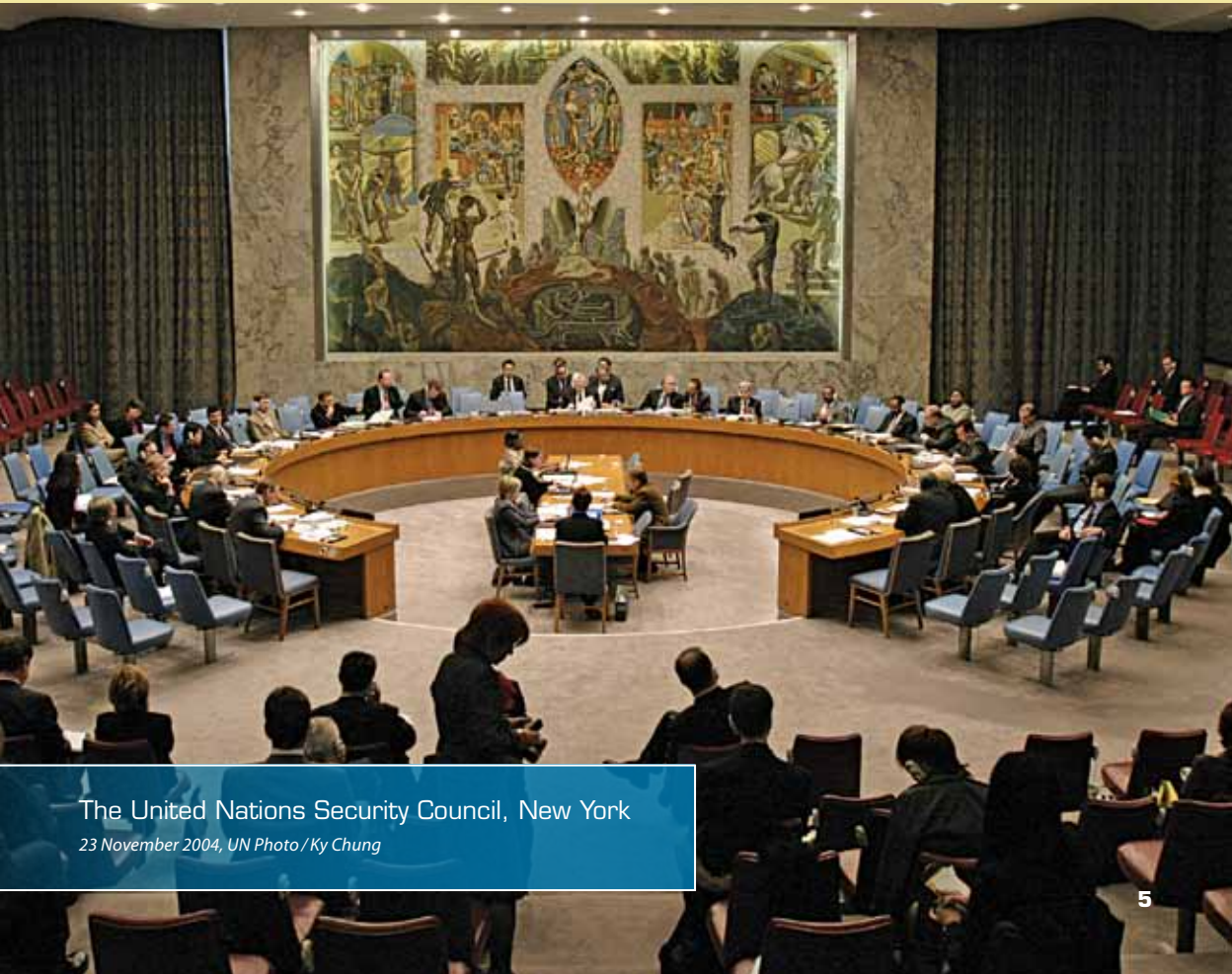
The United Nations Security Council, New York

equitable management of diversity. That means eliminating gross political and economic inequalities, and promoting a common sense of belonging on equal footing.